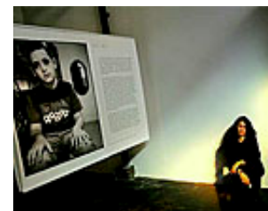
The witness

Ellen confesses that she finds men with multiple tattoos "sexy."